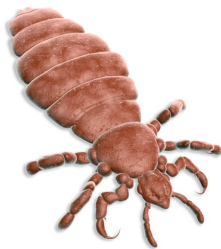
Adult Head Louse